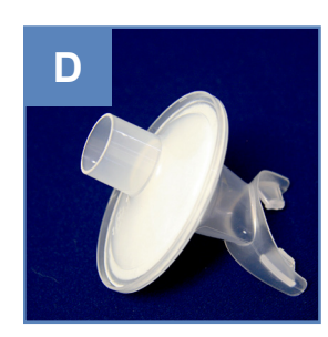
D) Single-use Mouthpiece