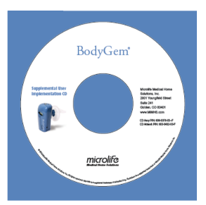
E) User CD

The BodyGem Device . This device measures RMR and displays the measurement results in the LCD screen at the front of the unit. The DC power supply, flow tube and mouthpiece attach to the main indirect calorimeter.